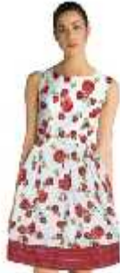
D-24 Mermaid Dress S, M, L, XL