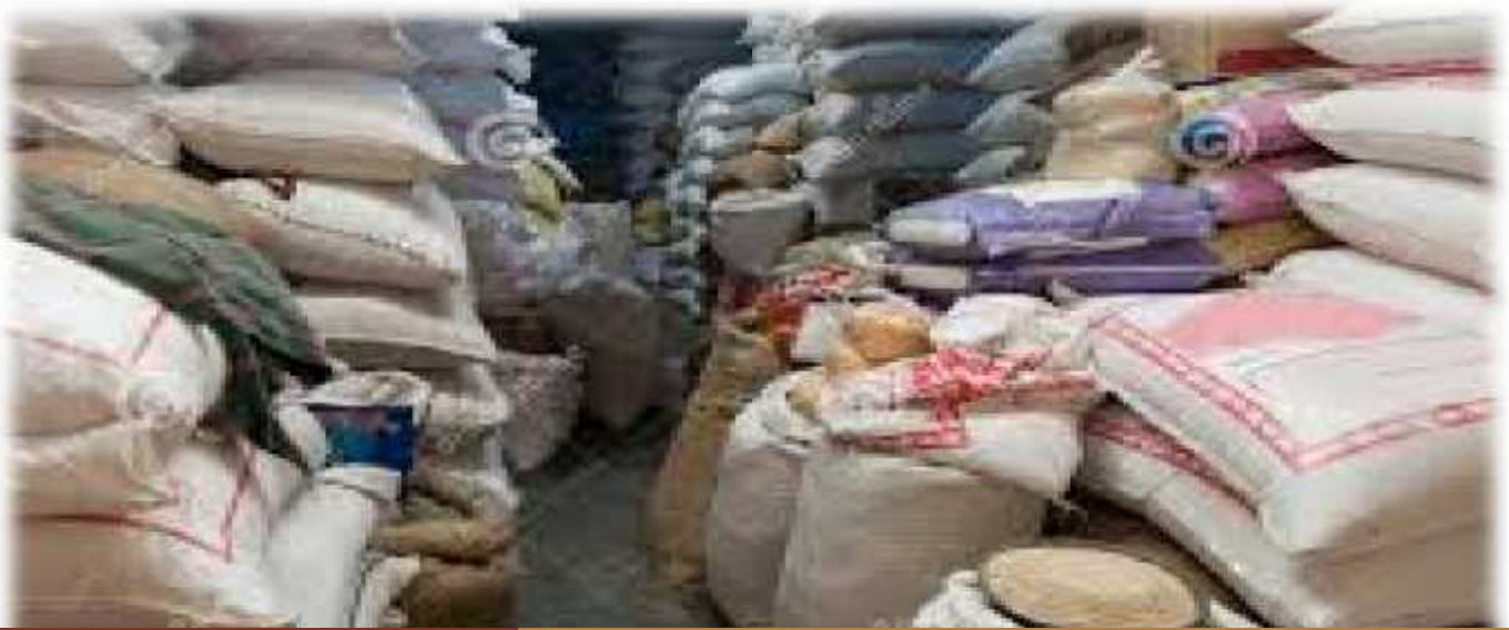
OUR MANUFACTURING UNIT